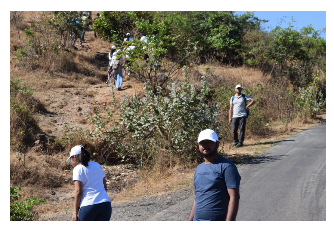
2. The trekkers from GITA institute